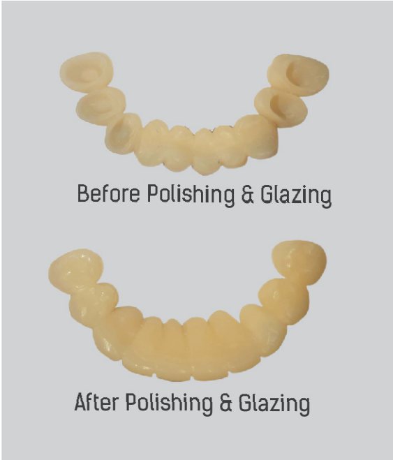
Printed C & B