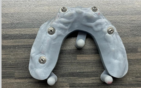
Screw retained prosthesis